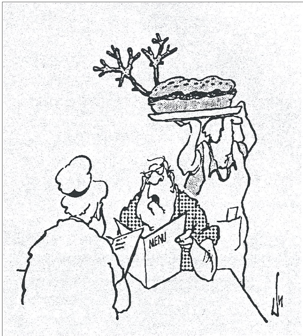
Look at the dopey names on this menu! What's a Wapiti Burger?