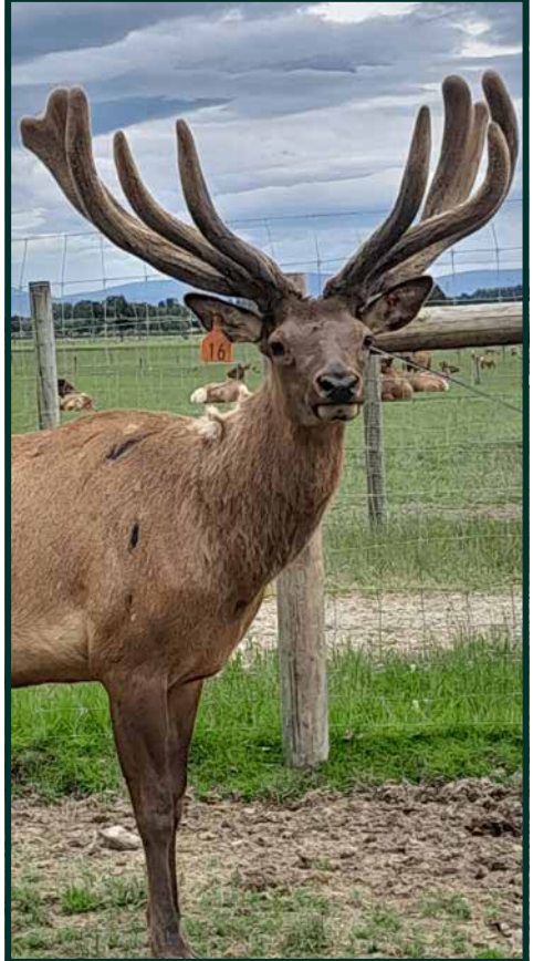
3yr old velvet of Orange 16

Orange 16 is a top velveter and a top trophy prospect. Orange 16 is was used as a sire in the 2024 season. He has 24 fawns on the ground.