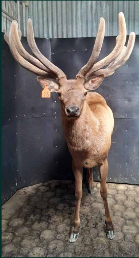
2yr old velvet of Orange 16